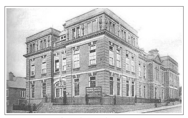
Figure 1. Berridge House.

The most renowned institution of this type was the Training College of Domestic Subjects, Berridge House, Hampstead (Fig. 1), opened in 1909 by the National Society for Promoting Religious Education. Berridge House was proud of its well-equipped Science Laboratory, and it was the first Domestic Science Training College in Britain to appoint a lecturer with a science degree.