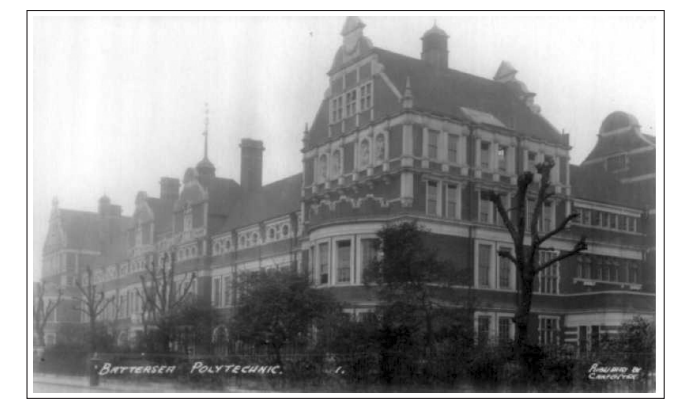
Figure 2. Battersea Polytechnic.

The continued strength of the chemistry content at Battersea from 1919 until 1948 seems to have been the